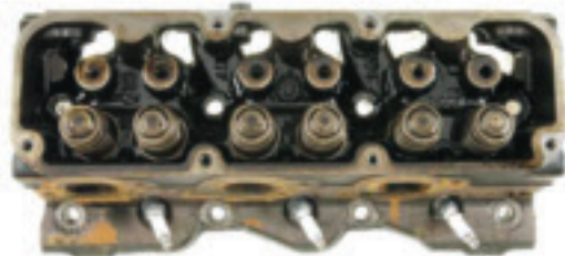
Cylinder head pre-cleanup. Note the sludge deposits on and around the valve springs and push rod openings.

NOTE: It is not recommended to flush transmissions that do not have a removable pan or access to the transmission filter.